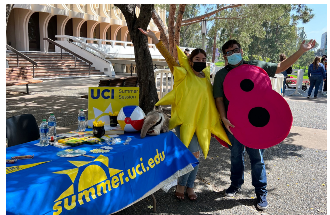
Summer Session's student workers tabling at SOAR's Puppies and Pathfinders Event.

UCI Summer Session allows for open enrollment and the courses they offer during the summer are available to everyone. The department offers courses in 70 different academic disciplines and students can choose from over 800+ courses during the summer (in-person or online courses) throughout their 3 sessions (Session 1, Session 10 week, and Session 2).