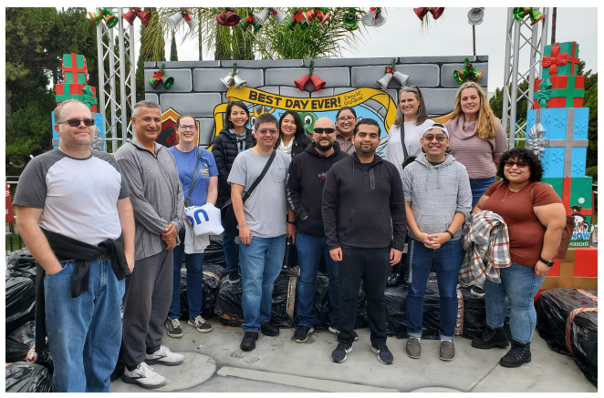
OVPTL, Division of Summer Session Team

There are many benefits for students who